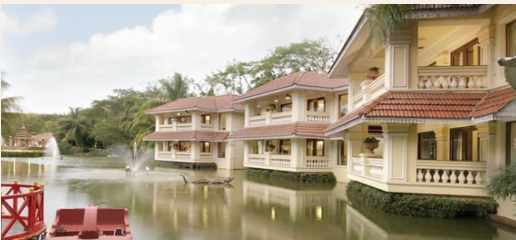
Mayfair Hotels & Resorts

This year venue is the Mayfair Convention situated opposite to the Mayfair Hotels & Resorts in Bhubaneswar. Mayfair Hotels & Resorts is truly a world class resort with unparalleled style, sophistication and elegance making it the best choice for a comfortable and magical stay in Bhubaneswar. Plush heavenly cottages and villas with exotic settings, tasteful interiors and a magnificent view of lake.